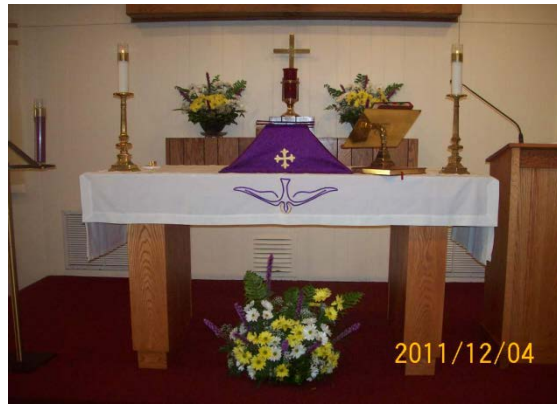
Floral Decorations at the Altar