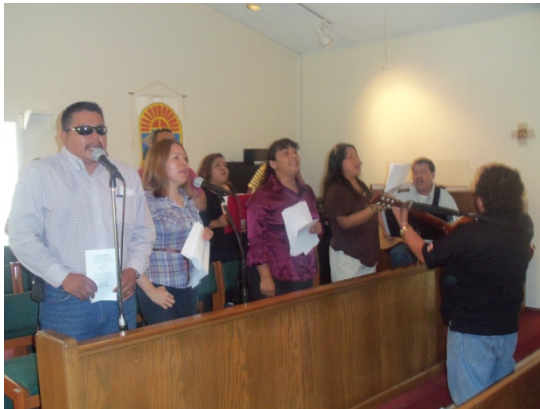
12:00pm Spanish Choir

Many specific Holy Days are recognized and appropriate services are held either at Holy Faith, or in some instances, we travel around to the other Episcopal Churches in the area for joint services, sharing with St Andrew's and St Simon's in Fort Pierce, and Nativity in Port St Lucie.