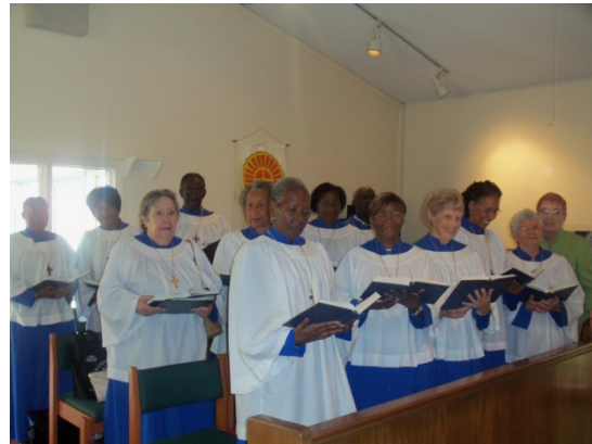
10:00 am English Choir